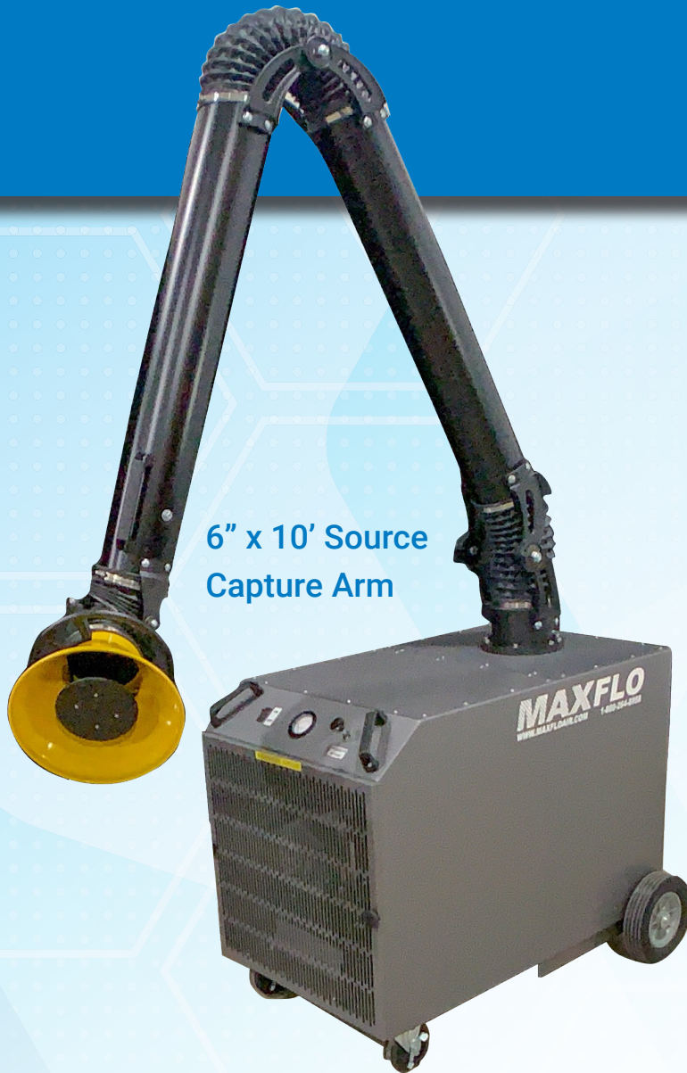
6" x 10' Source Capture Arm