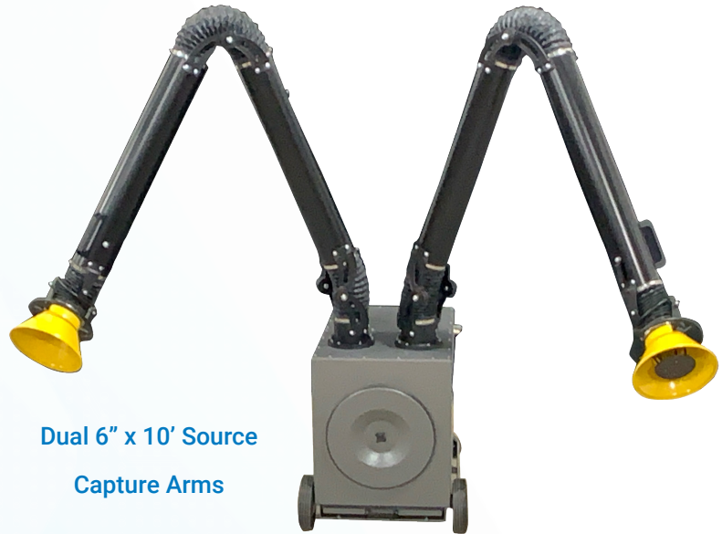
Dual 6" x 10' Source Capture Arms

Utilizing leading edge technologies such as our unique "Filter Hammer" sonic cleaning system ensure your mobile fume collector will perform at its best and give you a long cartridge filter service life. A simple pneumatic push button cleaning system (requires compressed air connection) and sealed dust tray make cleaning the systems a breeze. Our portable dust collectors provide ample airflow for even the heaviest applications. The 1 HP (PC-1) and 1.5 HP (PC-1.5) models will create a nominal 800–1200 CFM. MAXFLO portable collectors can also be fit with an activated carbon filter which removes gases, or a 99.97% HEPA.