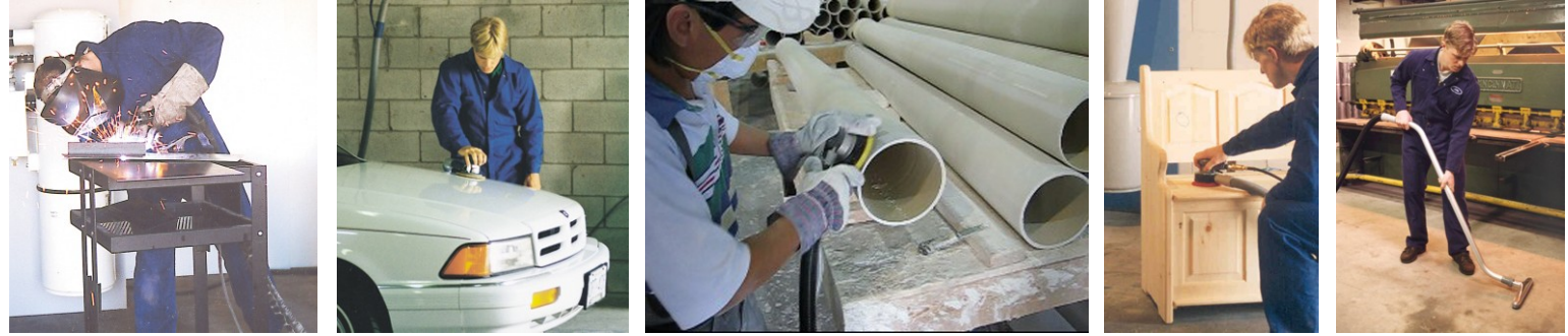
Note: Specifications listed above may be modified to suit application. contact D.A.S. or representative for information.

Diversified Air Systems, Inc. 10801 Electron Drive, Louisville, Kentucky 40299 Toll free: (800) 264-8958 Tel.: (502) 267-0333 • Fax: (502) 267-4241 Website: www.diversair.com • email: info@diversair.com