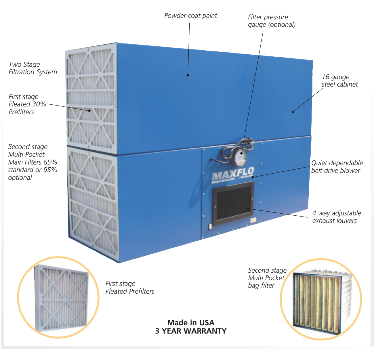
Ideal for automotive industry, welding shops, vocational schools, training facilities, laboratories, wood working shops, metal transforming industries, batching and powder processes.