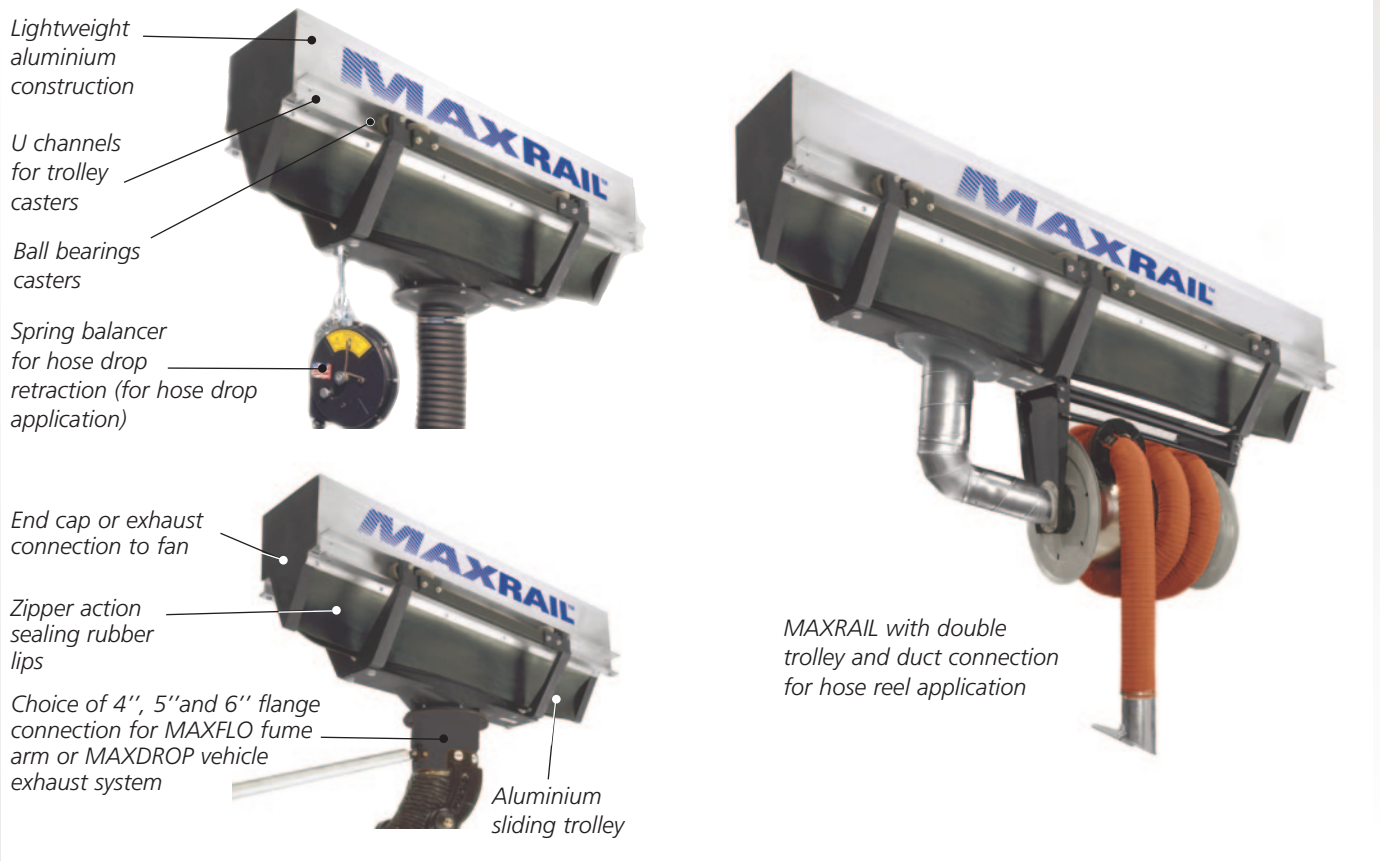
Recommended air flow for hose drop and hose reels